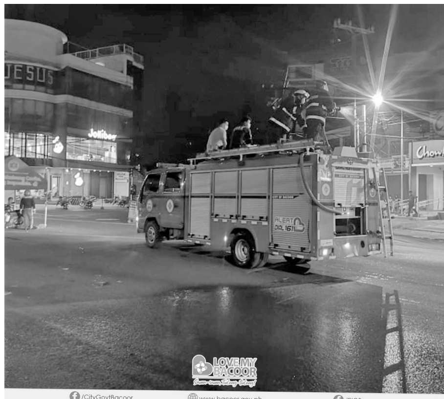
Facebook: /CityGovBacoor Website: www.bacoor.gov.ph Instagram: /PICBacoor

BFP Bacoor nag-disinfect sa kahabaan ng Zapote area kasama na din ang Zapote Market para mapigilan ang maaaring pagkalat ng virus sa paligid. Lubos na pag-iingat ang panawagan pa din sa bawat Bacooresoño.